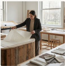
Spiritual Identity & Reconstruction

At a certain point, success stops feeling like freedom. This talk explores why this isn't a loss of capacity, but a loss of tolerance—and what it reveals about carrying too much for too long.