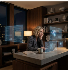
AI & Amplification

When what once felt certain begins to unravel, this talk explores reconstruction after inherited systems no longer hold—and the shift from deconstruction into alignment and self-trust.