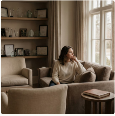
Midlife Identity & Alignment