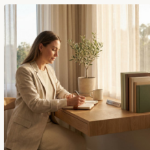
Self-Leadership & Personal Agency

What you've had to carry often becomes what you can't put down. This talk explores how invisible labor accumulates and centers around one person, and how to recognize and release what was never yours to carry.