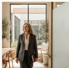
Identity & Behavioral Patterns

Often the things you've had to carry become the things you can't seem to put down. This talk explores how invisible emotional, relational, and mental labor accumulates, and why it so often centers around one person. Audiences will learn how to recognize what they've been holding, why it feels necessary, and how to release what was never theirs to carry.